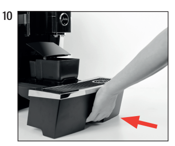
'Filter operation' / 'Filter rinsing complete'